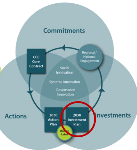
Cities Mission Climate City Contract